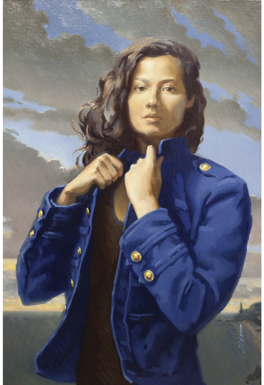
Calm before the storm , by Toby Wright